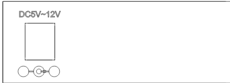
Fig.3 Rear panel