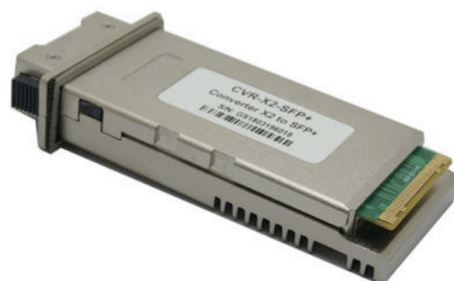
Table 1-lists the SFP+ transceiver modules that can be plugged into the Converter Module.